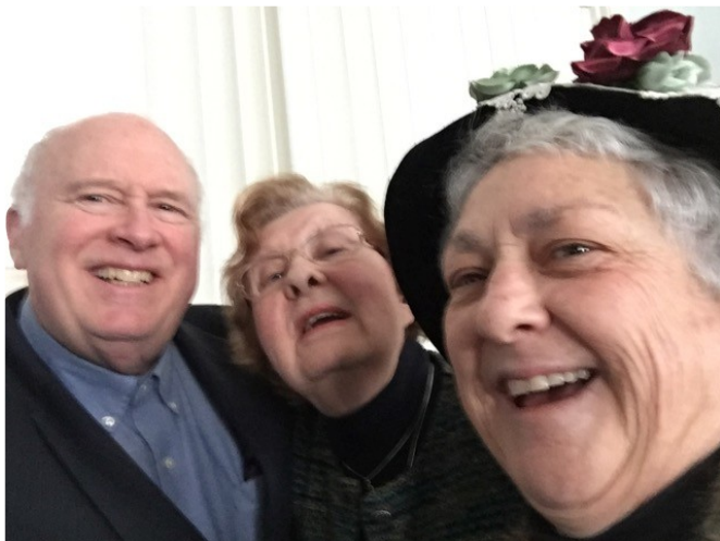
Later, she was joined by the rest of the cast.

Historian, writer, producer, and narrator posed for a selfie with two of the cast.