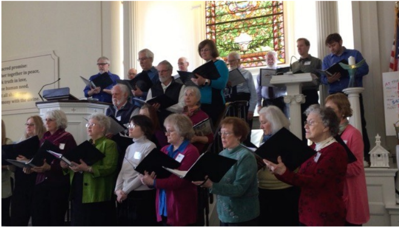
They sang beautifully.

The Triquire of the York County Unitarian Universalist Churches of York County performed three songs three times. On three successive Sundays, they sang together at each of the participating churches- Sanford UU Church, First Parish UU Church of Kennebunk, and the UU Church of Saco and Biddeford.