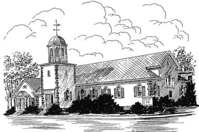
Sanford Unitarian Universalist Church Sanford, Maine