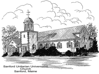
Sanford Unitarian Universalist Church Sanford, Maine