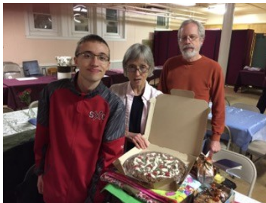
One lucky family outbid the field for Ruth Leipold's renowned chocolate pizza.