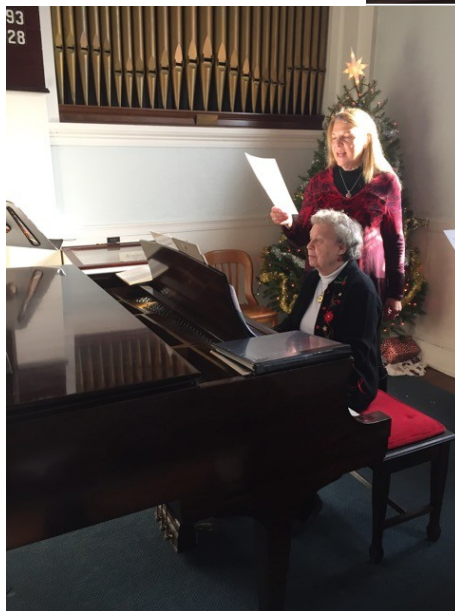
And more rehearsing