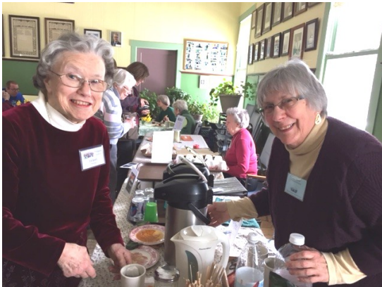
Coffee and chocolate go great together.