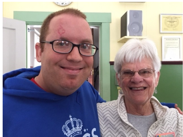
Old-timers reconnect...over chocolate.