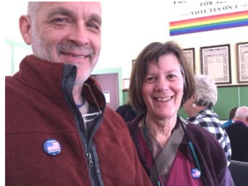
These Americans support a FREE PRESS.

CLYNK - On Thursday, March 2nd, $70.00 was picked up at Hannaford Supermarket from the church bottle and can returns. On November 4th, $120.95 was picked up giving us a total so far of $190.95. We thank all who participate in this program; money collected from this is entered into our fundraising line. CLYNK bags are available on a table in Goodall Hall. Together we can make a difference!