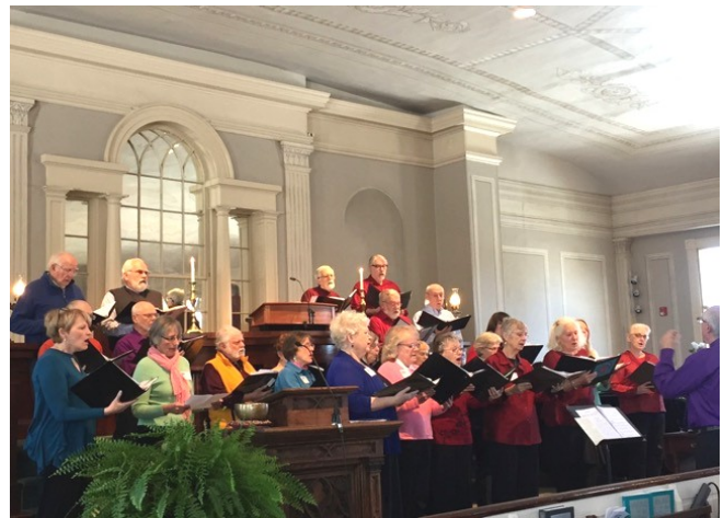
TriQuire in Kennebunk