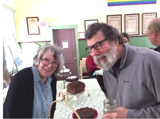
West Newfield people love all kinds of chocolate!