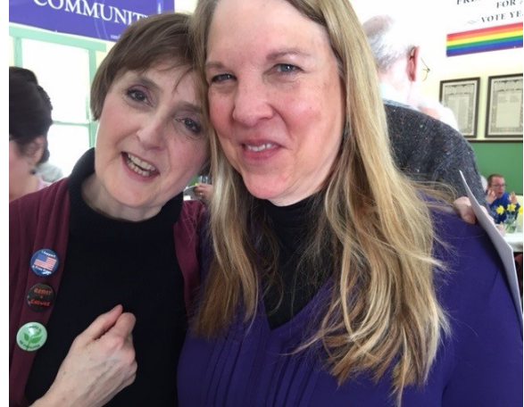
Sisters in song!