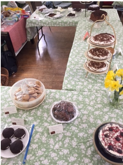
Rain and Vicky like chocolate.