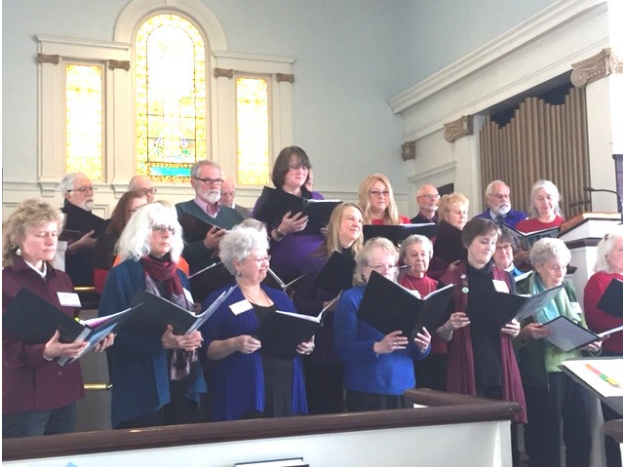
A breath before singing - Sanford, Kennebunk and Saco-Biddeford Choirs together.