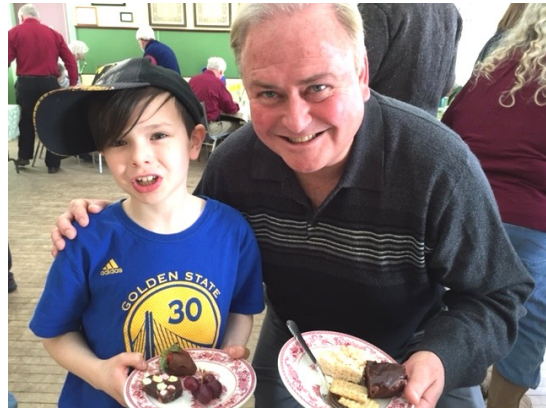
Say "cheese" and show chocolate!