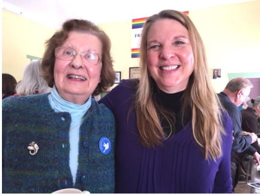
Chocolate went well, now we are talking about a tea!