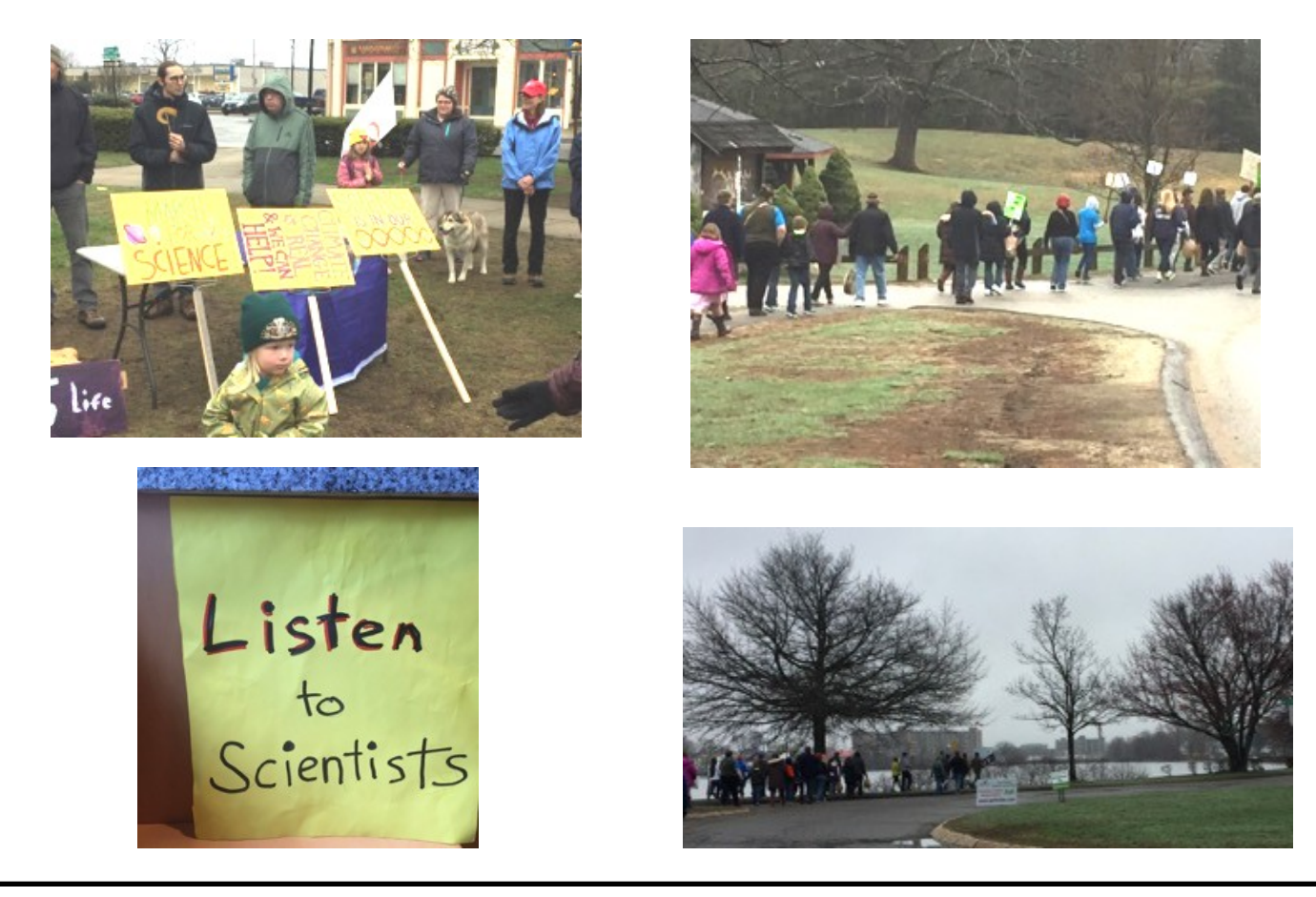
Page 8 "...be the change you wish to see in the world." Gandhi May 1, 2017 Issue #11