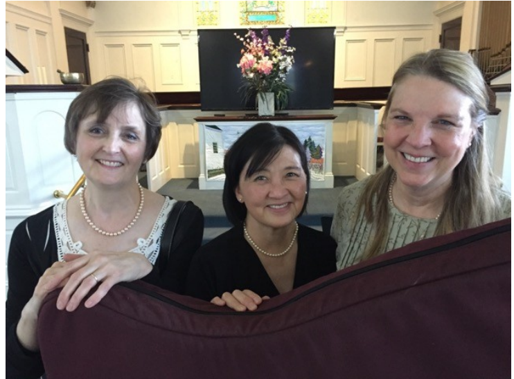
Three happy harpists behind a packed-up harp.