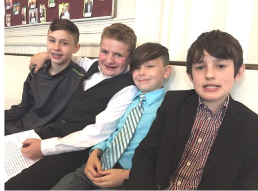
Four sharp gentlemen all in a row!