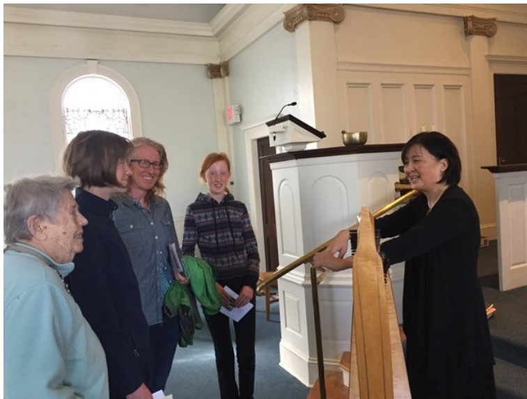
Musically-oriented local and out-of-town Reusches had some questions.