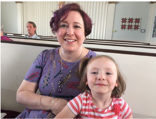
Two happy UUs!