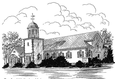
Sanford Unitarian Universalist Church Sanford, Maine