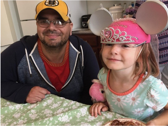
The Quinns in caps!