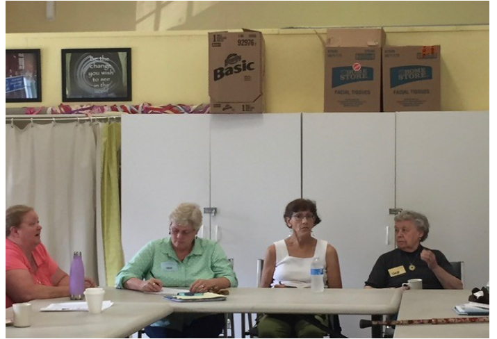
Listening and speaking at one of our Cottage Meetings.