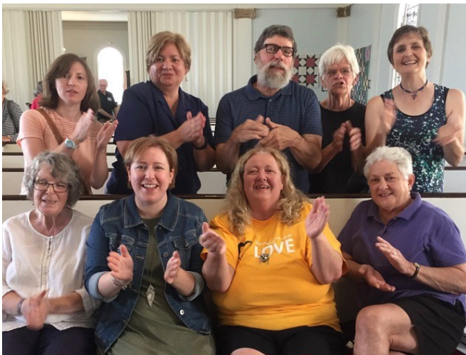
Our wonderful Worship Associates huddling, laughing and singing!