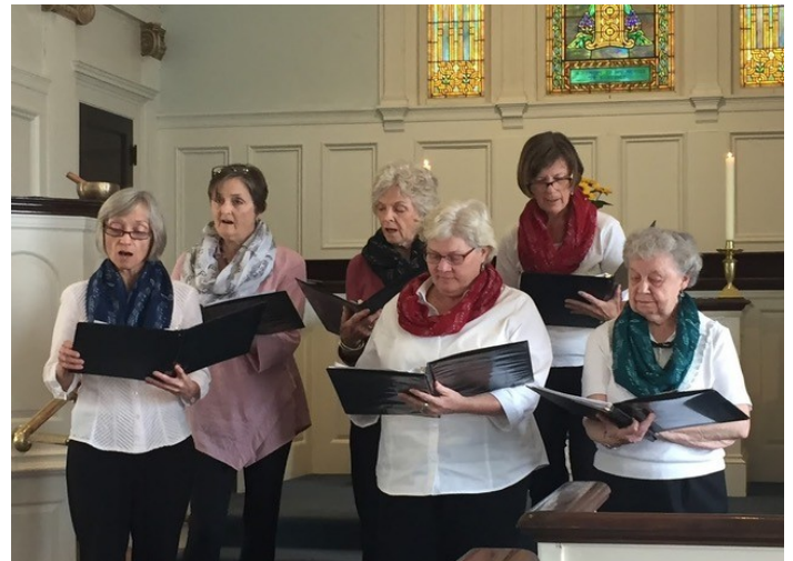
Our UU Notes