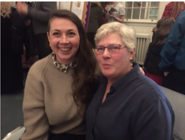
Alumni Christmas visitors arrived from Gorham and Berwick...