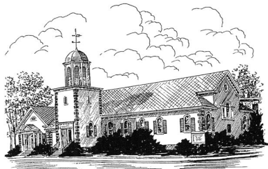
Sanford Unitarian Universalist Church Sanford, Maine